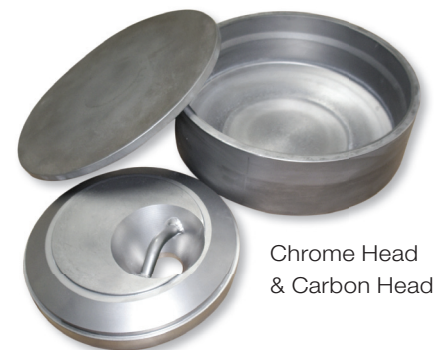
Chrome Head & Carbon Head