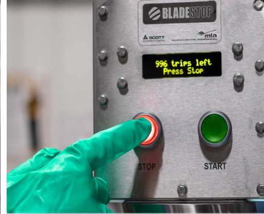
Quick Restart no blade change required after a stop

The BladeStop's unique sensing and fast-stopping capabilities are the difference between having a near miss or an amputation.