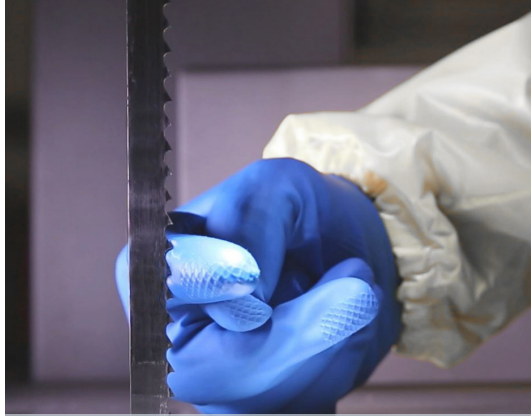
Industry Leading Stopping Time fastest on the market