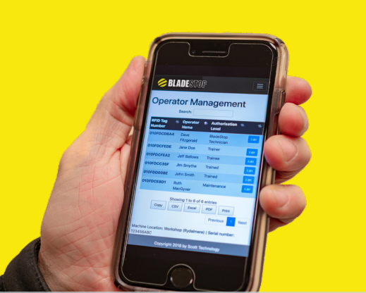
BladeStop Connect real time & historical data reporting