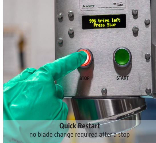
Quick Restart no blade change required after a stop

The BladeStop's unique sensing and fast-stopping capabilities are the difference between having a near miss or an amputation.